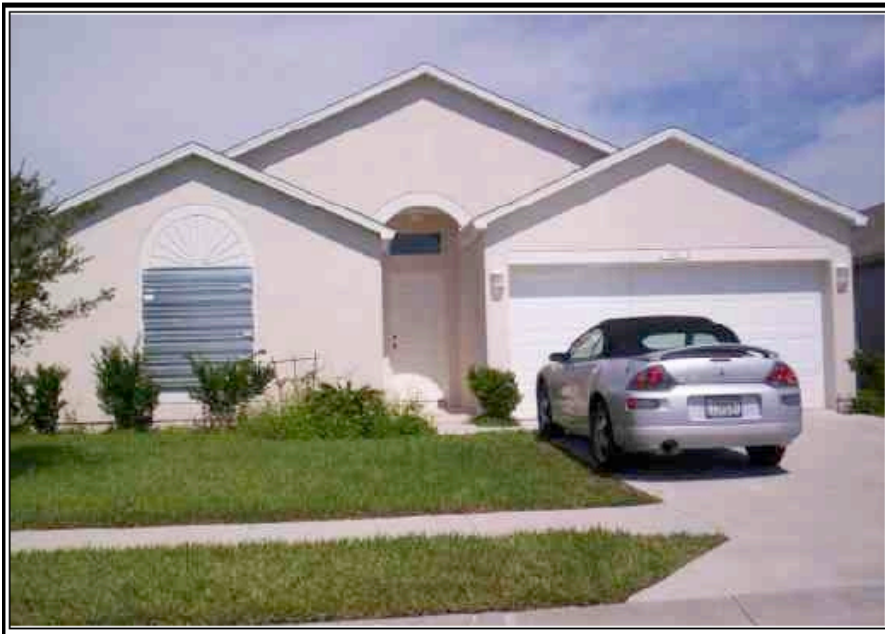
FRONT OF SUBJECT PROPERTY 71414 South Bascom Ave San Jose , CA 95128